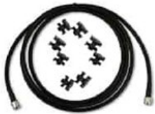
Booster Cable and Clips