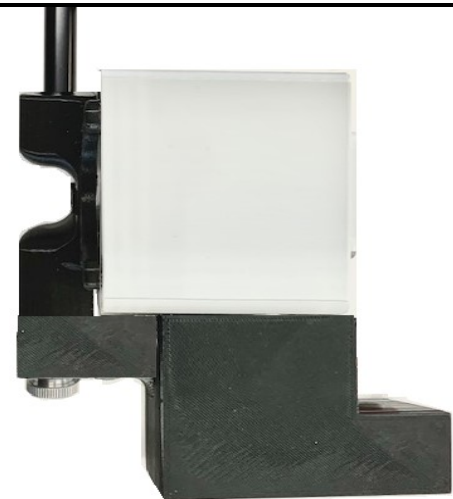
E. Mount installed on post-2022 Loop

F. Insert a screwdriver into the notch to remove the lid on the mount